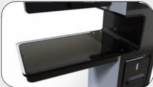
x-plor checkout area