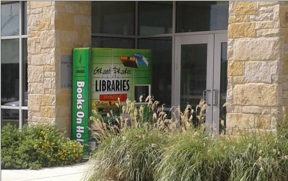
D-Tech's custom-colored, 32-bay holdIT at the Grand Prairie Library in Texas.